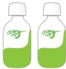
Two bottles of CLENPIQ (5.4 oz each)